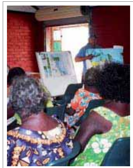
GBRMPA staff conducted community information sessions in over 90 centres along the coast, enabling interested individuals to get information and ask questions.