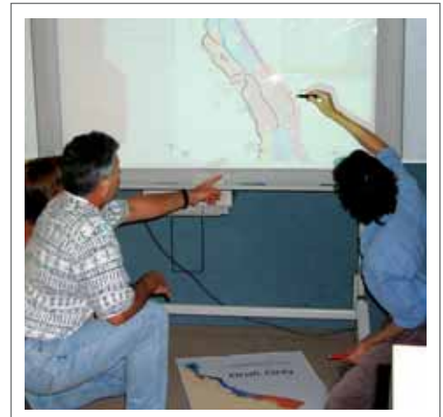
Experts applied their specific knowledge to help develop a map of 70 bioregions that became a fundamental cornerstone of the RAP for the entire Marine Park

economic or cultural impacts on Marine Park users and stakeholders. The linking of science, technical support and community participation was an essential three-way dynamic in the planning process.