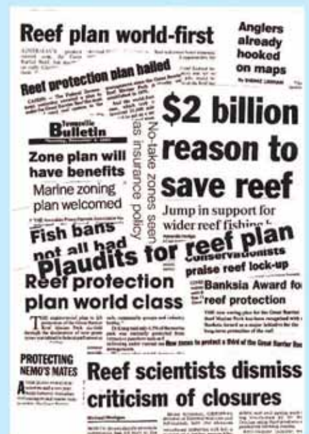
Some of the local and national media after the RAP was finalised

In November 2004, the State of Queensland 'mirrored' the new zoning in most of the adjoining State waters, so now there is complementary zoning for virtually all the State and Federal waters within the entire Great Barrier Reef World Heritage Area.