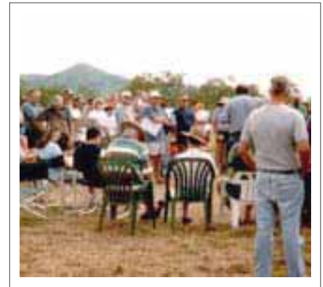
One of the many meetings held out in the various local communities along the Great Barrier Reef coast to explain the zoning process and to encourage public submissions as an important part of the planning programme.