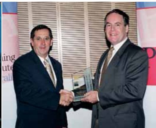
At the 2005 National Planning Awards ceremony, the Planning Minister's Award was accepted on behalf of all staff of the GBRMPA.

For more information on the zoning of the Marine Park visit www.gbrmpa.gov.au . More detailed information on the Representative Areas Programme can also be found on the Great Barrier Reef Marine Park Authority website under Zoning, 'Information for Managers and Planners'.