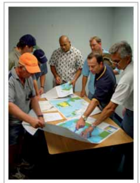
Listening to the views of local fishers was an important part of the planning process