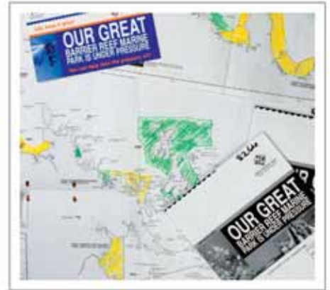
Many public submissions used the submission forms that were specifically prepared and widely distributed by the GBRMPA

In accordance with the Great Barrier Reef Marine Park Act 1975 , once the revised Zoning Plan was approved by the Board, it was submitted to the Minister for the Environment and Heritage for consideration. A Regulatory Impact Statement and comprehensive assessments of the social and economic impacts of the revised Plan were also submitted. The Minister approved the Zoning Plan and tabled it in both Houses of Federal Parliament on 3 December 2003. Following the statutory period for Parliamentary consideration (15 sitting days), the Minister announced that the new Zoning Plan would be implemented on 1 July 2004.