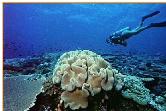
Diving is a popular activity for tourists visiting the GBRMP.

The tour vessels used by operators range in size from small sailing vessels, which typically take fewer than 20 people, to the large wave-piercing catamarans, which carry up to 400 people. There are also an increasing number of cruise ships visiting the GBRMP, with bookings to cruise ship anchorages increasing from about 200 in 2000, to nearly 600 in 2002.