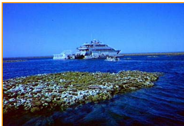
For many visitors to the GBRMP the tourism fleet is their primary means of experiencing the Great Barrier Reef.

International, national and regional visitors are drawn to the Great Barrier Reef and for