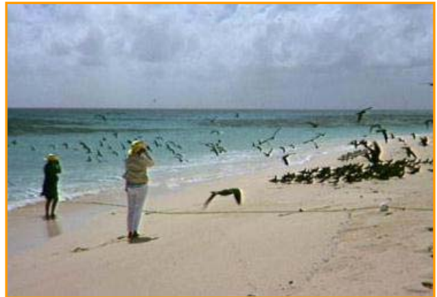
Particular management focus is given to protecting seabirds from disturbance, especially during nesting seasons.

The Tourism and Recreation Group is undertaking a number of projects to address high priority tourism and recreation issues.