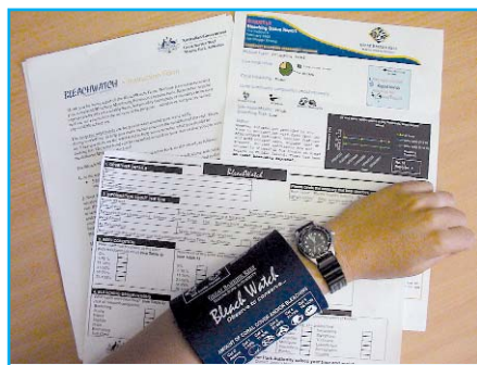
Figure 3: BleachWatch Kit.

Many regular reef visitors already play a key role in the GBRMPA's ability to detect the early signs of coral bleaching through weekly BleachWatch reports submitted during the summer season. GBRMPA provides these reef users with a monitoring kit (Figure 3), and participants receive specially