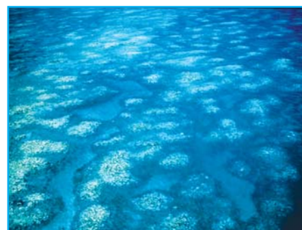
Figure 4: Aerial image of a bleached reef.

BleachWatch also relies on participation from Coastwatch and charter flight operators who can detect and report mass bleaching of reefs they may regularly fly over. The aerial component of BleachWatch is also the most effective method for obtaining a synoptic overview of where bleaching is occurring over the full spatial extent of the Great Barrier Reef Marine Park.