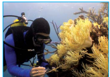
Figure 2: GBRMPA staff undertaking surveys as part of the Coral Bleaching Response Plan.