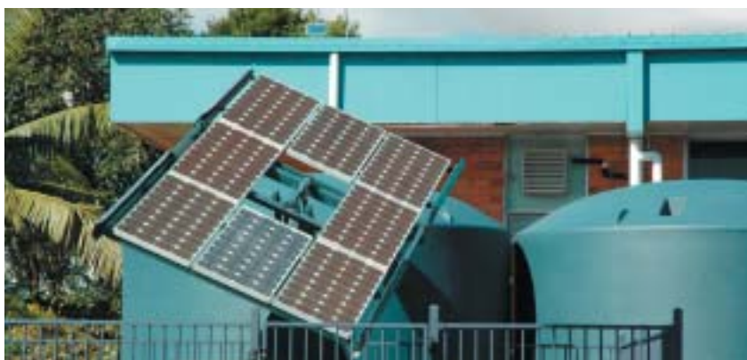
Solar power panels can be installed at home to reduce electricity use