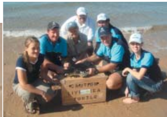
Alva is released off Magnetic Island

Alva a hawksbill turtle was released off Magnetic Island, just in time for World Turtle Day, thanks to Reef HQ Aquarium and the Department of Environment and Resource Management.