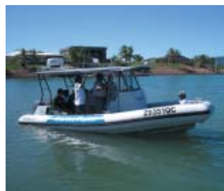
Territory visitors took time out to accompany field staff on a boat patrol

The Anindilyakwa Land Council represents the Aboriginal people of the Groote Eylandt archipelago located on the western side of the Gulf of Carpentaria, around 600 kilometres East, South East from Darwin.