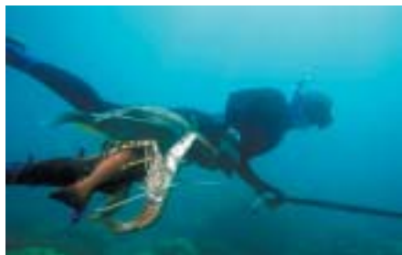
Check a Zoning Map before heading out to go spearfishing

Alternatively, call the Great Barrier Reef Marine Park Authority 1800 990 177 for a free map.