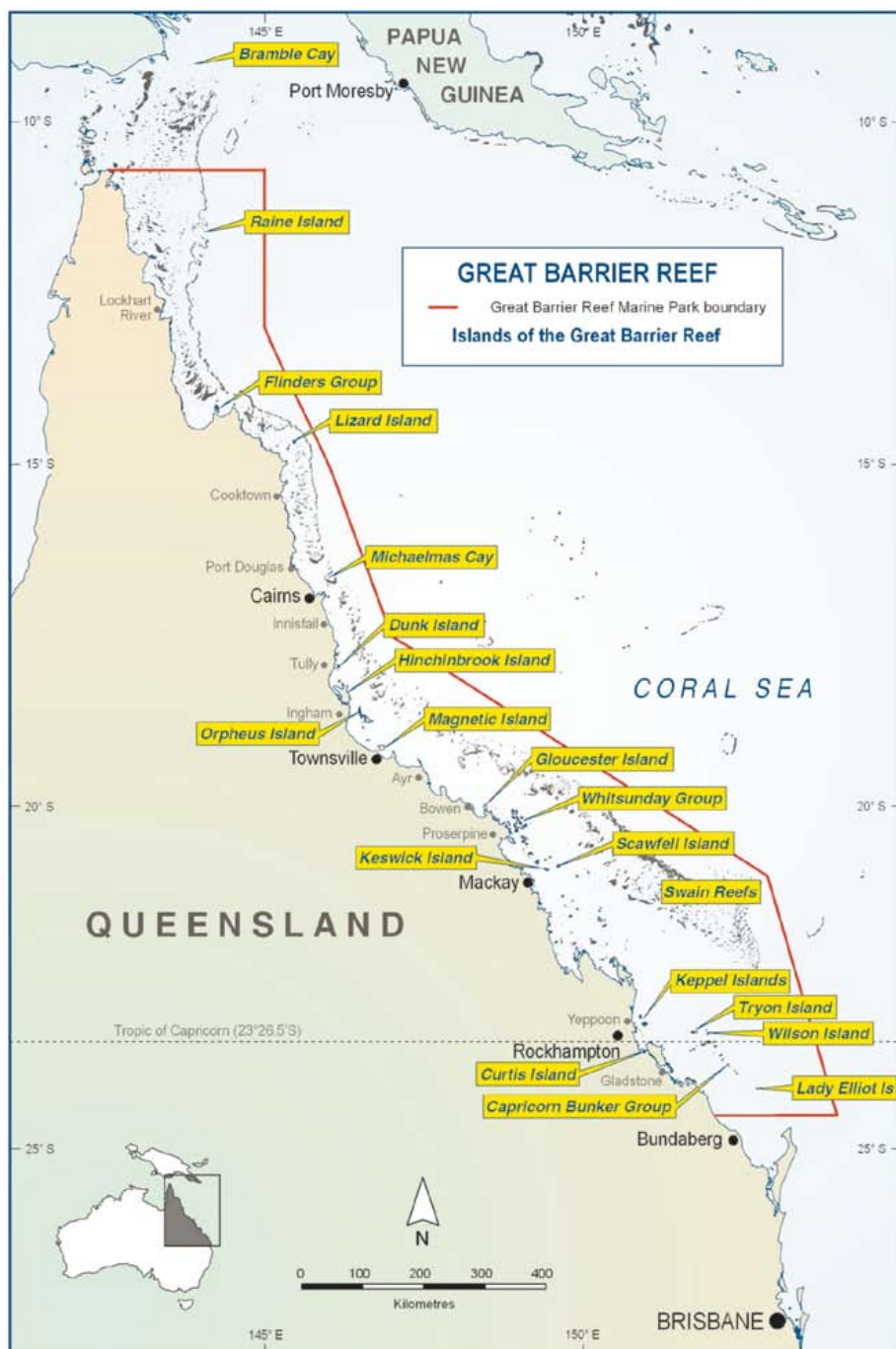
Figure 20.1 Map of the GBR region indicating key islands and their locations