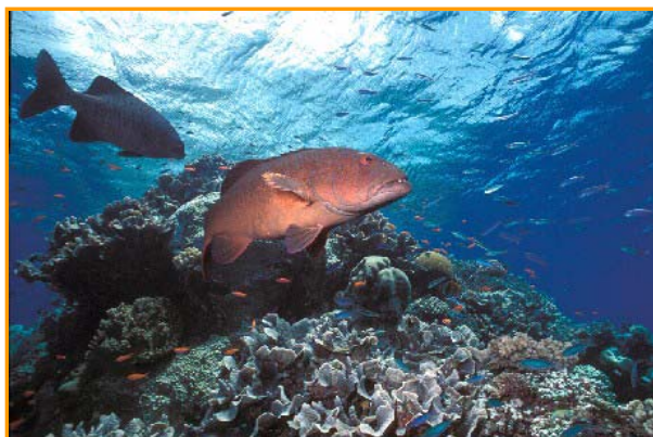
In recent years, fisheries management plans have been introduced for the east coast trawl fishery and the coral reef finfish fishery.

Fisheries management plans have been completed for some fisheries including the East Coast Trawl Fishery and the Coral Reef Finfish Fishery. Several prawn species are commercially harvested from the Great Barrier Reef and there are signs that some of the key species are harvested at or above maximum sustainable levels. Additionally, research has shown that trawling places significant pressure on seabed habitats and results in a large amount of bycatch. The East Coast Trawl Fishery Management Plan 1999 resulted in a significant reduction in fishing effort, in terms of the number of operators in the fishery, the days fished and the areas fished. The Plan also introduced measures to reduce bycatch.