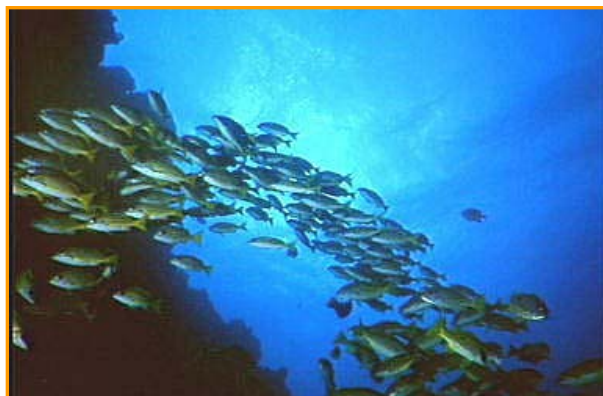
Effective fisheries management is crucial to the long-term sustainability of fishing, but also to the health of the Great Barrier Reef.

The GBRMPA, however, continues to have responsibility for the management of the Great Barrier Reef Marine Park under the Great Barrier Reef Marine Park Act, 1975 . In essence, the GBRMPA is responsible for the conservation of the fisheries resources of the Great Barrier Reef Marine Park, whereas Queensland is responsible for the management of the fisheries that use these resources. The GBRMPA's management tools include the Zoning Plan that describes where fishing activities may occur and how they must be conducted. Areas zoned as Marine National Park or 'green zones' prohibit extractive uses such as fishing and collecting