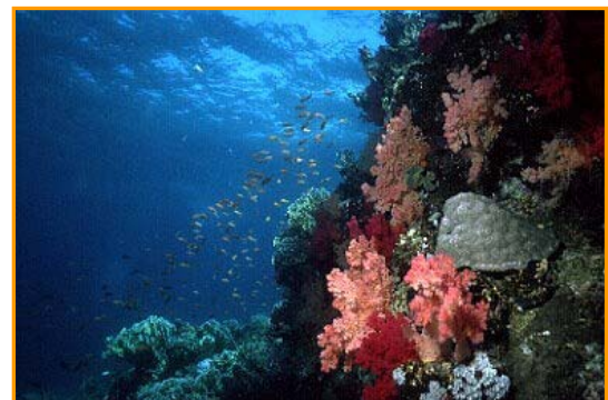
While many areas of the Great Barrier Reef are in good condition, mounting pressures on the Reef leave no room for complacency.

Despite these pressures, the Great Barrier Reef is still a wonderful natural asset for Australia and the world. Many areas are still in very good condition but there is no room for complacency on the part of managers or the community. Given the increasing pressures on the Great Barrier Reef, active protection is required to ensure that the Great Barrier Reef remains an intact and functional ecosystem, and that human use of the Reef is sustainable now and for the future.