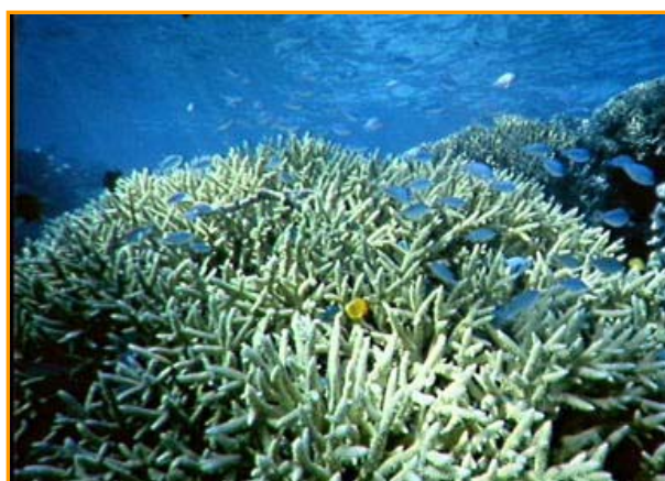
Protecting biodiversity, reducing land based pollution and ensuring that fisheries are sustainable are vital steps in helping coral reefs cope with climate change.

The latest report from the United Nations Intergovernmental Panel on Climate Change reaffirms that global climate change is a reality and the evidence that it is being accelerated by human activities is stronger than ever. Warmer sea temperatures associated with climate change are likely to increase the incidence of coral bleaching on reefs around the world. In 1998 and 2002, the Great Barrier Reef experienced the two worst recorded coral bleaching episodes, with the 2002 event causing declines of between 50 and 90 percent of coral cover on some inshore reefs.