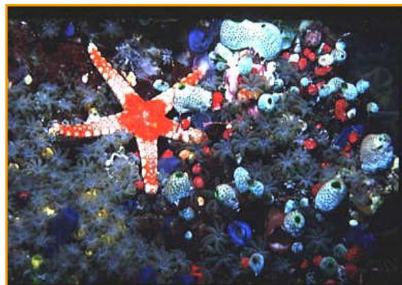
The Great Barrier Reef is made up of many different habitats, all of which are essential for the healthy functioning of the Reef ecosystem.

This network will also help to ensure that the biodiversity and ecological functions and connections that sustain the Great Barrier Reef are maintained. Increased levels of pollutants from terrestrial run-off also pose risks to habitats such as seagrass beds.