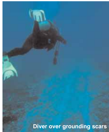
Diver over grounding scars

immediate vicinity of the vessel's impact with the shoal. A scar of 20-30m in width and approximately 100m long is present. The team has also found long and wide sections of scarring across the shoal. Initial inspections have also been conducted on the site where the vessel was eventually