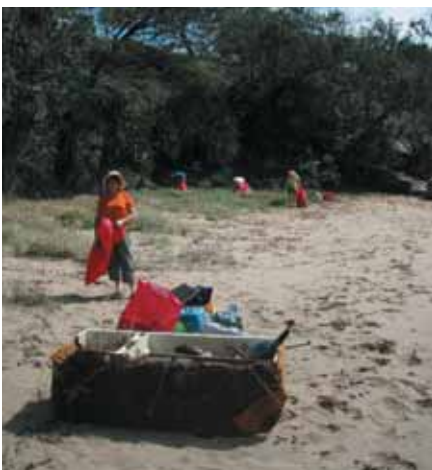
All kinds of rubbish is left on the beaches