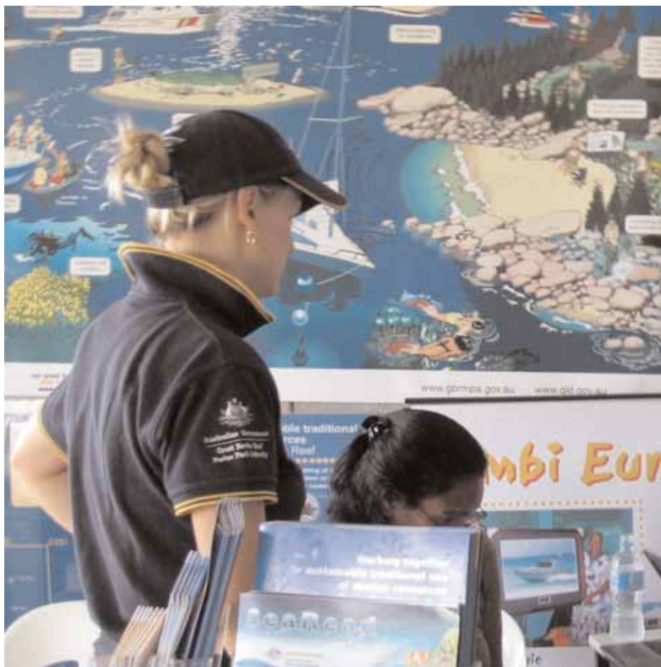
There was much to see and do

The three-day event and weekend cultural festival saw a great number of attendees, among them Traditional Owners from across Australia and a range of government agencies.