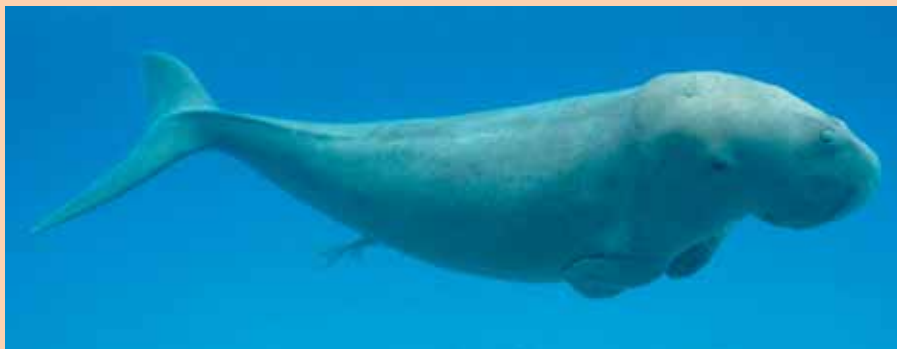
Dugongs are in trouble throughout the southern area of the Marine Park