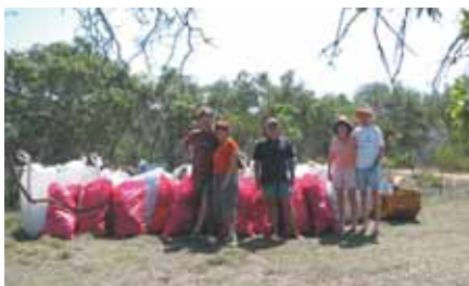
The Curtis Island clean up team with the rubbish they found

The Fitzroy Basin Association also aided by paying for vehicles and camping equipment to be taken to the island via a barge.