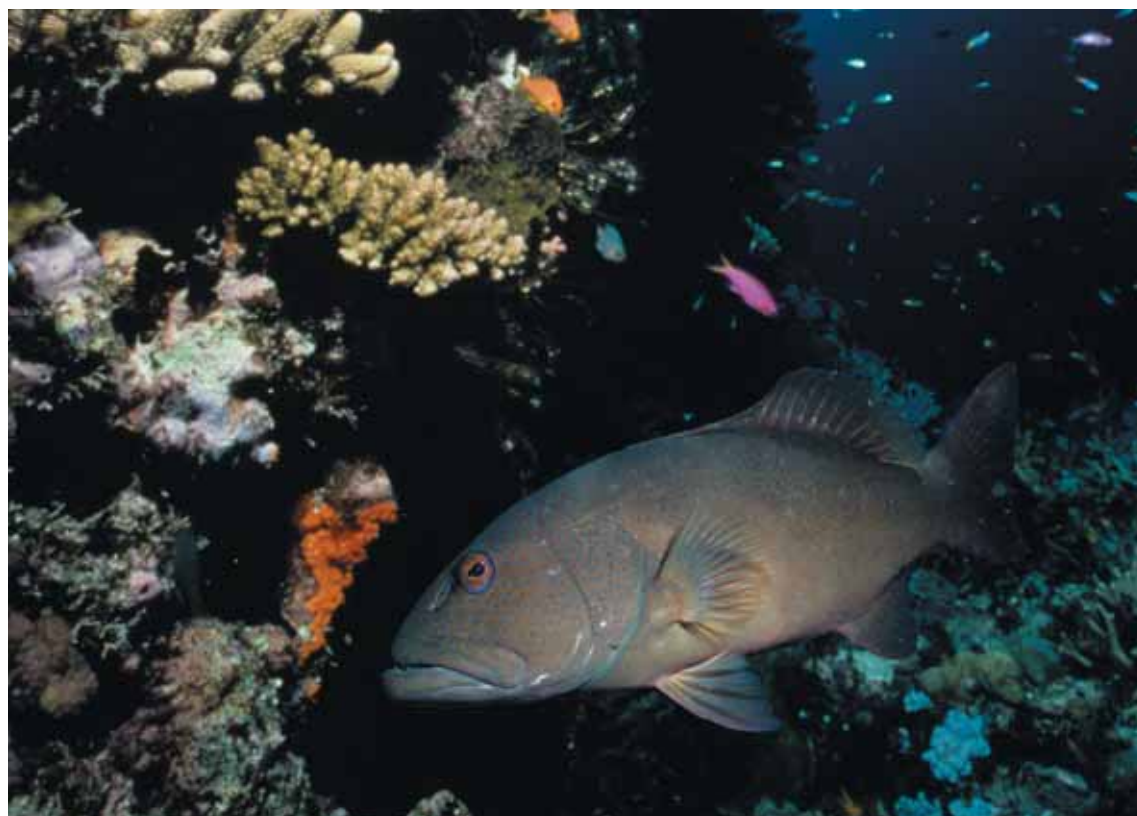
Prices for live coral trout could be the incentive behind illegal fishing