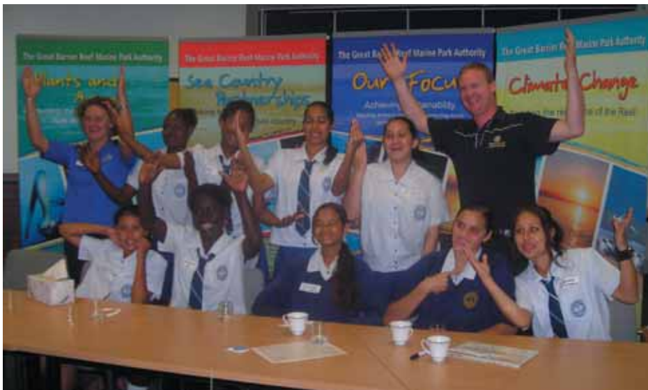
The reef video conference connected students from around the world

In the last twelve months reef video conferencing has been used to reach over 4000 students from all over Australia and around the world including countries such as England, France, Greece, South America, Alaska, South Africa, New Zealand and the USA just to name a few.