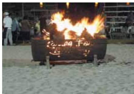
Part of the festivities at the Land and Sea Conference