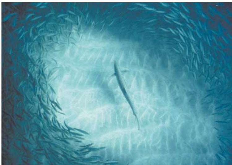
Figure 18.2 School fish and piscivores: a predatory spanish mackerel hunting hardy heads

Caranx ignobilis , giant trevally; Carangoides fulvoguttatus , gold-spotted trevally), Coryphaenidae (eg Coryphaena hippurus , dolphinfish) and at the largest end of the fin-fish tree the sailfish and marlins of the family Istiophoridae (eg Istiophorus platyerus , sailfish; Makaira mazara , black marlin).