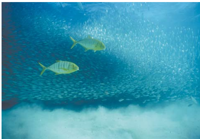
Figure 18.3 Baitfish are a critical source of food for piscivores: Golden trevally patrolling a school of bait fish (hardy heads)