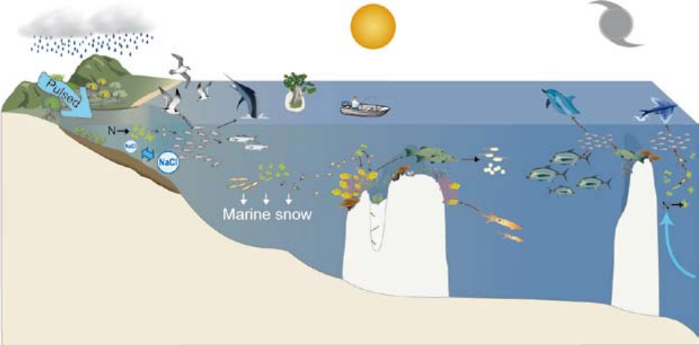
Figure 18.1 Profile of the GBR from inshore to offshore showing key organisms of the tropical pelagic food chain, and physical features of the pelagic environment that influence organisms (eg upwelling and riverine runoff)