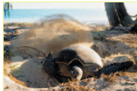
Keep an eye out for marine turtles on local beaches

For more information about marine turtles in the Great Barrier Reef World Heritage Area see www.gbrmpa.gov.au or www.deh.gov.au/coasts/species/turtles .