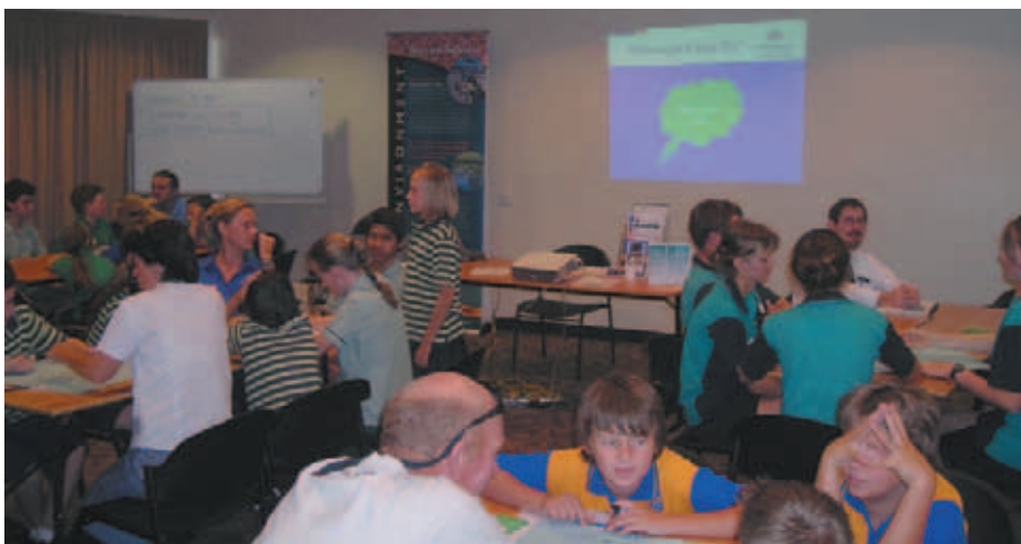
Gladstone students put their heads together to develop new environmental initiatives