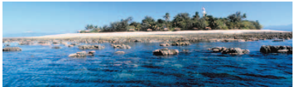
Marine monitoring is taking place on Low Isles off Port Douglas