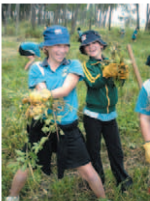
Beaconsfield State School work on their revegetation project

The Reef Guardian Schools programme is an education initiative of the Great Barrier Reef Marine Park Authority that develops partnerships between students and their communities to work towards protecting their environment and the Great Barrier Reef.