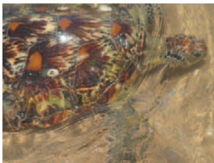
Hookie gets back in the water after being at the Turtle Centre

A green turtle rescued from the Rockpool, after a fishing hook was embedded in his flipper, began a new adventure when he was released off Magnetic Island.