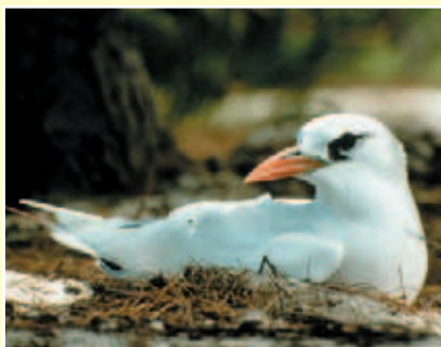
The report provides an overview of birds in the Marine Park

A full copy of the State of the Reef Report chapter on birds is available online at www.gbrmpa.gov.au/corp_site/info_services/publications/sotr .