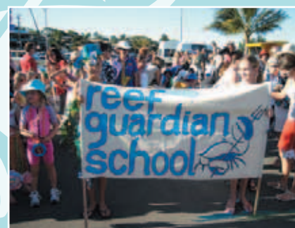
Cannonvale State School students took out the schools section of the Reef Festival Parade

Cardwell State School will use the funding to develop an environmental display for the Cardwell 'Seafest'. 'Seafest' is a community educational festival celebrating the coast.