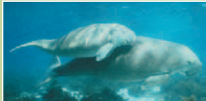
The community-driven approaches cover dugong and turtles

Community driven approaches to sustainable management of dugong and marine turtles across north Australia are central to a project funded by the Australian Government Natural Heritage Trust.