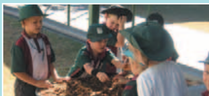
Year one students at Wondai State School prepare to mulch their gardens

In 2006, Beaconsfield State School worked with community groups to revegetate a parcel of land close to their school. The students worked with the Mackay Local Marine Advisory Committee, Mackay City Council and Pioneer Catchment and Landcare Group to remove weeds, create a wetland and provide a corridor to join two rainforest areas.