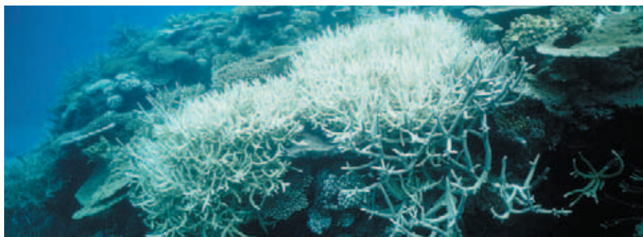
The new publication sheds important light on coral bleaching