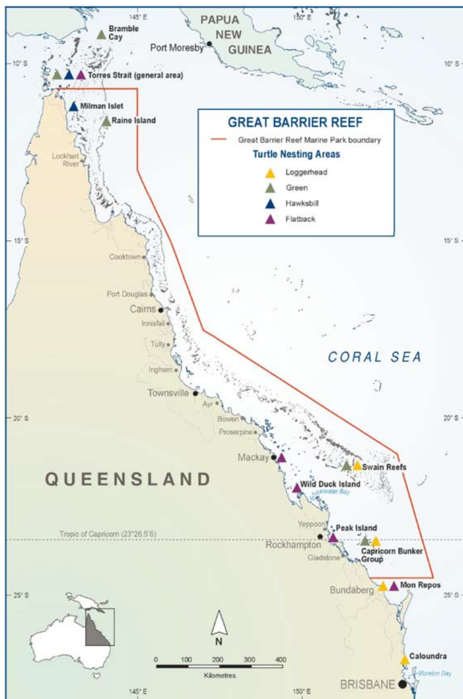
Figure 15.1 Distribution of significant turtle nesting and foraging areas referred to in this chapter