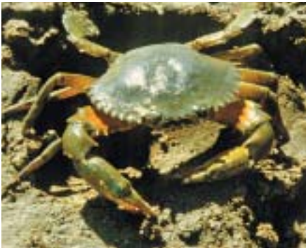
The common crab will help monitor the quality of water entering the Great Barrier Reef

Creepy crawly crustaceans are set to help the Great Barrier Reef Marine Park Authority (GBRMPA) shed light on the declining quality of water entering the Marine Park.