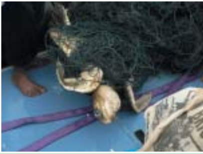
When the turtle was first brought onboard, it was clear she would not have survived if Orion passengers had not spotted her...