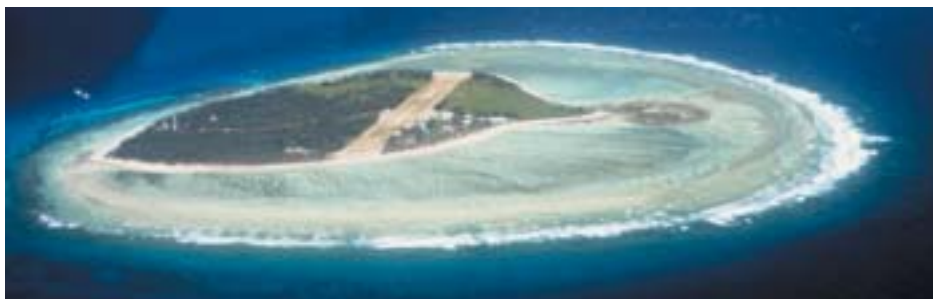
Lady Elliot Island, offshore of Bundaberg, is the southern most island in the Great Barrier Reef Marine Park