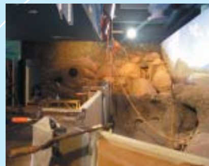
Under construction: The wetlands exhibit begins to take shape

The exhibit is a collaboration between the Burnett Mary Regional Group, Mackay Whitsundays Natural Resource Management (NRM) Group, Burdekin Dry Tropics NRM, Far North Queensland NRM, Townsville City Council and NQ Water.