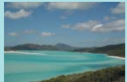
Hill Inlet requires a Plan of Management as it has been identified as a setting five area

Once prepared, draft site plans will be made available at www.gbrmpa.gov.au . To discuss site plans further or to request hard copy documents contact Matt Carr on (07) 4750 0784.