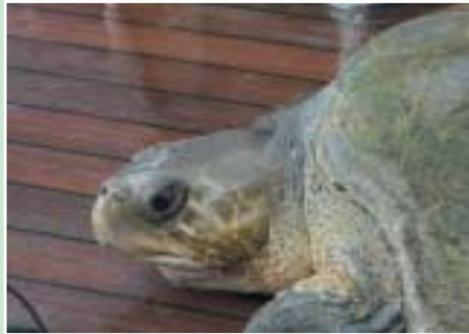
Enjoying some quiet time on board the luxury cruiser...

The crew acted quickly, pulling the distressed turtle on board the Orion and cutting her free of the net.