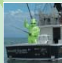
Lucky T 'fishing'

The series of photos and information on each destination will appear in the Townsville Bulletin from June 2006.