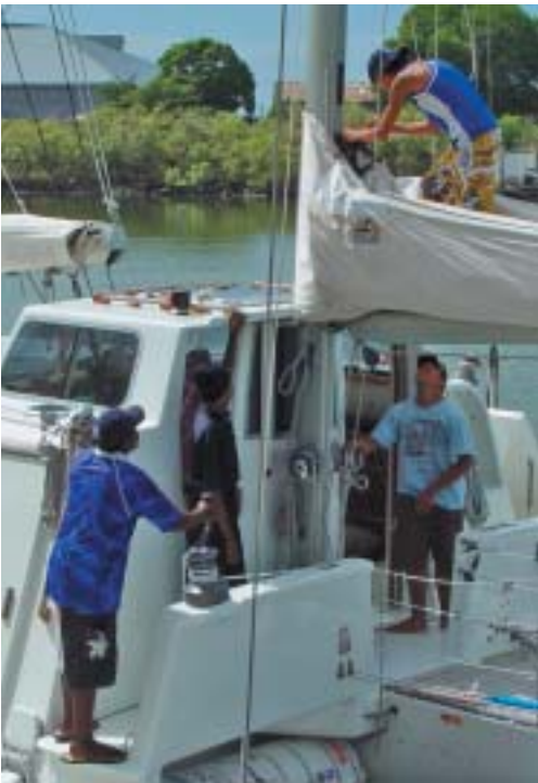
Indigenous trainees' onboard Pelican 1

The pilot project supports the passage and training for Coxswain certificates and open water/dive masters tickets for the trainees.