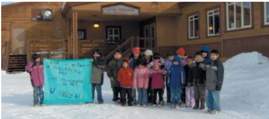
Although the snow was falling outside these Alaskan students experienced the wonders of the Great Barrier Reef from inside the four walls of their classroom