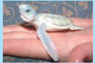
The newest addition to Reef HQ

Reef HQ Aquarium, welcomed its newest addition recently a unique "white" green turtle hatchling.