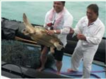
After carefully cutting the masses of net from around the turtle, she was happy to be free...

On a recent expedition of the Great Barrier Reef World Heritage Area, passengers on board the Orion Exhibition cruise ship spotted some net floating in the water with a flipper slapping at the surface.