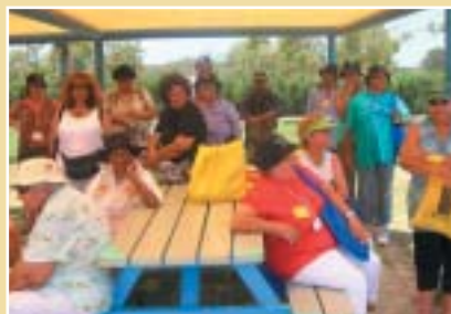
Woppaburra People come together on Great Keppel Island

The Woppaburra People extended their thanks to GBRMPA for their support.