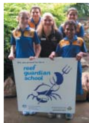
Gladstone South State School are recognised as a Reef Guardian School in 2006

"A couple of classes will also travel to Reef HQ in Townsville to learn more about the Reef and see it up close."