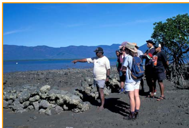
Cross-cultural education provides an excellent opportunity to learn about Aboriginal cultures.

As part of GBRMPA's cross cultural education program, a cultural education camp to Goold Island was organised for Queensland Parks and Wildlife Service (QPWS) and GBRMPA staff in 2002. The Giringun Elders and Reference group at Cardwell were contracted to provide the cultural learning outcomes as well as the camp logistics with the assistance of the QPWS vessels. The camp provided excellent opportunities for sharing and understanding Aboriginal cultures, traditional rights and interests in the Marine Park and how to facilitate the development of better working relationships in the future.