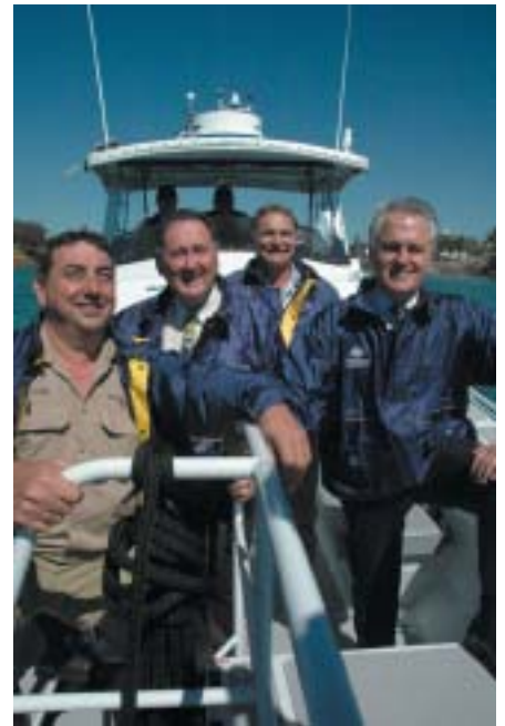
The Minister for the Environment and Water Resources launched the new boat in Townsville

Its 500 nautical mile range, high response speed and shallow draught makes it ideally suited for work in the north of the Marine Park.