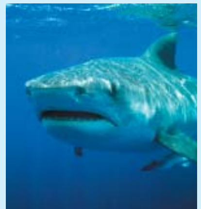
Tiger sharks were the stars of the community forum