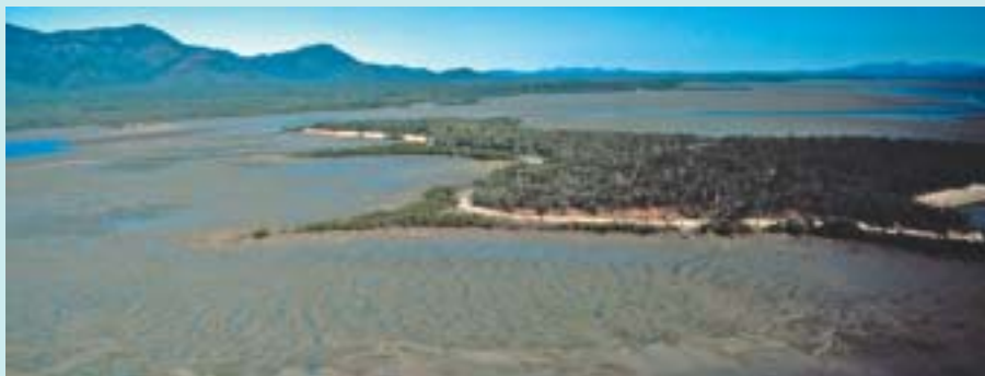
The report examines the quality of water entering the Marine Park

"The Reef Water Quality Protection Plan provides the framework for improving land management practices that effect water quality in the Reef catchment."