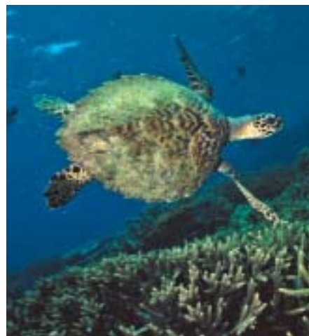
Research is unlocking the key to turtle health trends

It may also be a valuable indicator of the environmental status of the habitat.