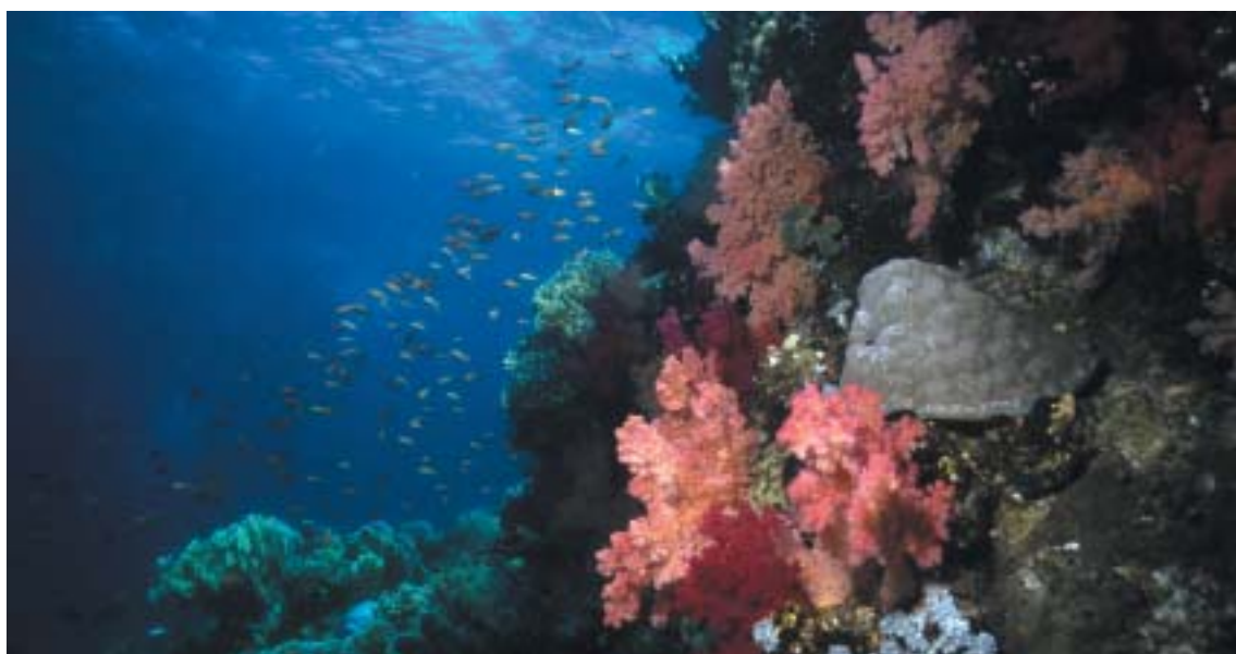
Councils have pledged their support to protecting our Great Barrier Reef

Councils along the Queensland coast have signed up for an innovative environmental programme that will help protect the Great Barrier Reef.