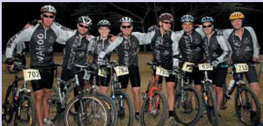
GBRMPA staff cycle for a good cause during the Paluma Push

Colleagues helped the bike riders raise $300 for the Rural Fire Brigades of Paluma and Waterfall Creek.