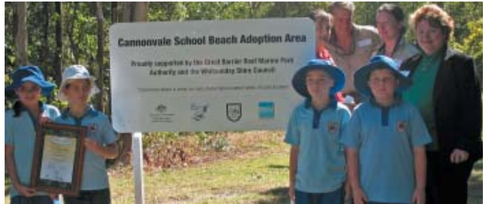
Students celebrate the beach adoption

"This is the first official Reef Guardian Schools beach adoption in conjunction with their local council.