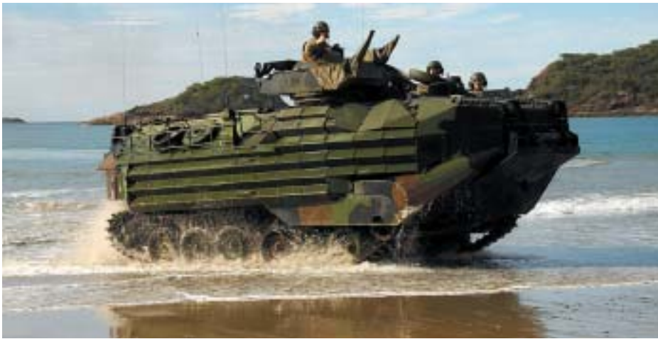
A US Marine Corps armoured amphibious vehicle during the training

"This involves a combination of consultation at local, state and national levels, using research and conducting an environmental impact assessment."