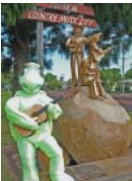
Lucky T hangs out in Charters Towers

The roadshow aimed to increase teacher knowledge of Townsville and the educational facilities available within the region. This information will assist schools in planning upcoming excursions and camps within the area.