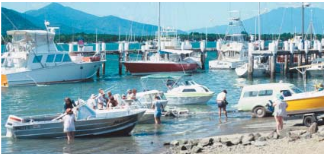
The GBRMPA calls on boaties to pick up their free zoning maps as recreational vessel registrations continue to rise

Recreational vessel registrations in the Great Barrier Reef region are on the increase and the Great Barrier Reef Marine Park Authority (GBRMPA) is calling on all boaties to pick up their free Marine Park zoning map.