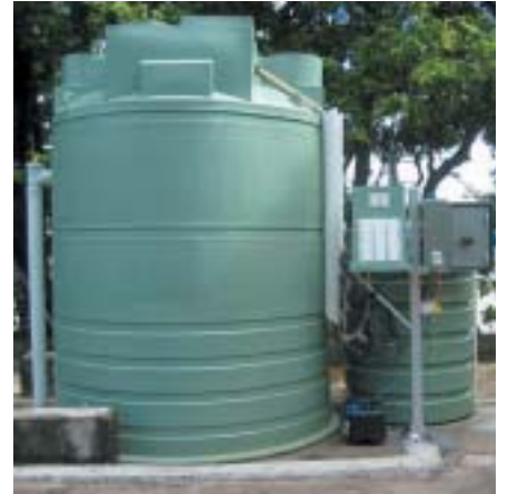
The new tertiary water treatment plant at Low Isles is exceeding expectations

"Indications are that the system is exceeding our expectations."