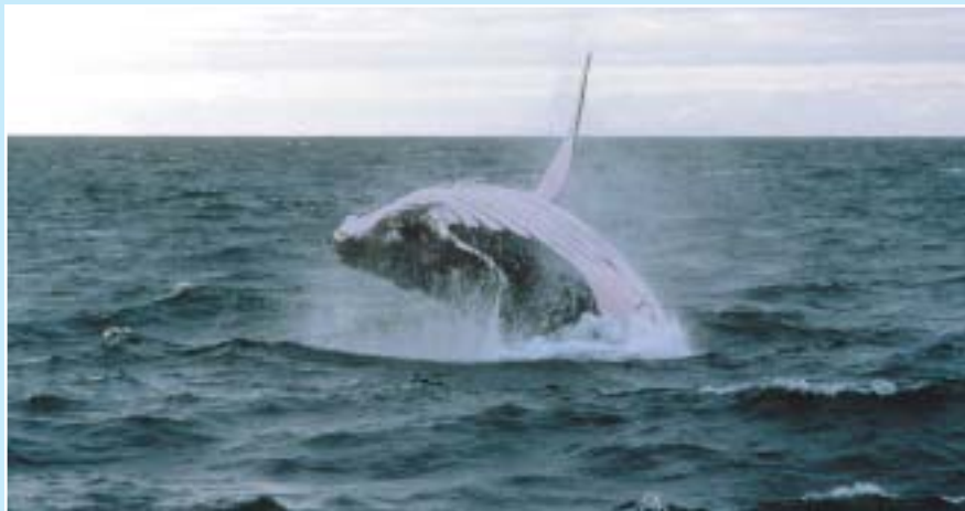
Whales are expected to be in the Great Barrier Reef Marine Park until September

For more information go to www.gbrmpa.gov.au/corp_site/key_issues/conservation/threatened_species/whales_dolphins.html .