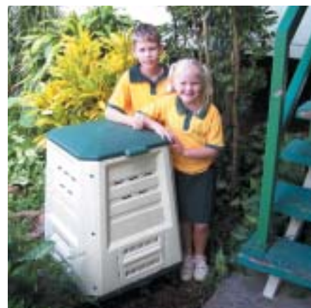
Mena Creek State School students with their worm farm

Mena Creek is just one of many Reef Guardian Schools that are doing their bit to help protect their environment and the Great Barrier Reef Marine Park.