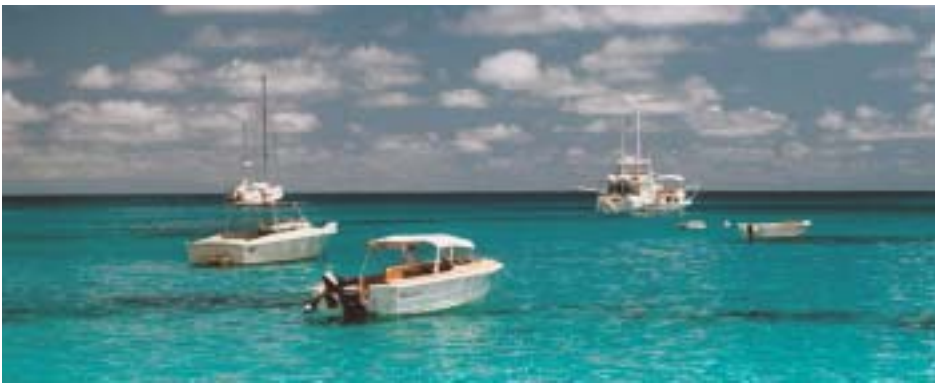
The pristine environment in the Marine Park will be better protected from foreign fishing vessels