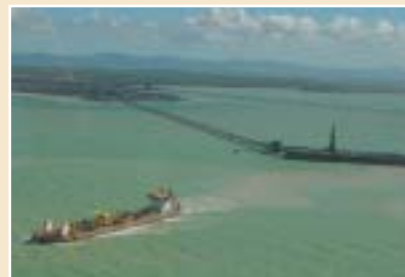
The second week of dredging gets underway at Hay Point

"The WD Fairway is the world's largest hopper suction dredger at a length of 233.35 metres. It has a