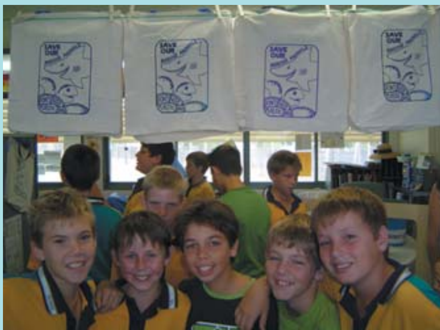
Willows State School students say no to plastic bags

"We hope the students not only had a fun day but learned to appreciate the environment and had a think about what it means to them and why they want to protect it."