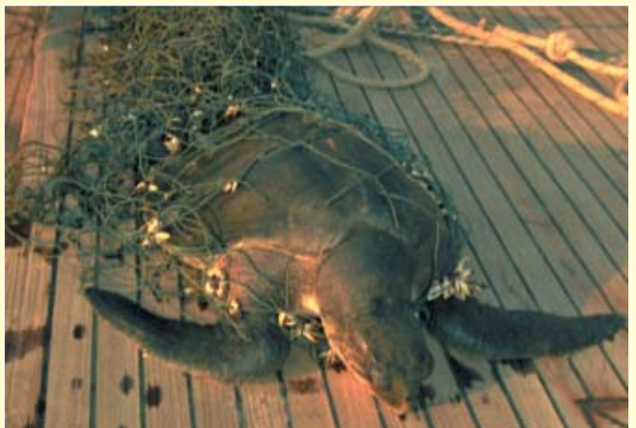
The Carpentaria Ghost Net programme is helping to save precious marine animals

For more information on the Carpentaria Ghost Net Programme, visit www.ghostnets.com.au .