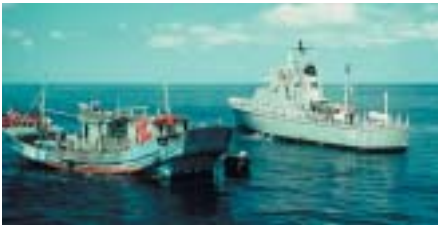
A foreign fishing vessel intercepted in northern Australian waters

The latest funding complements operations involved in maritime surveillance and enforcement undertaken by the Joint Offshore Protection Command, a joint initiative by the Australian Defence Force and Australian Government agencies.