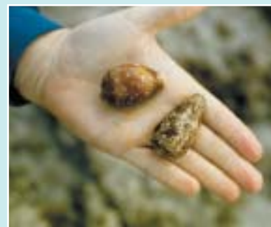
Help ensure natural treasures are left behind for others to enjoy