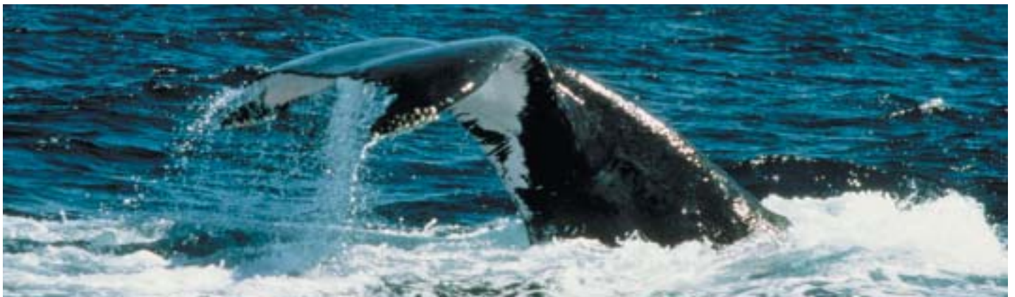
Workshops assist in saving marine animals along the Great Barrier Reef coast