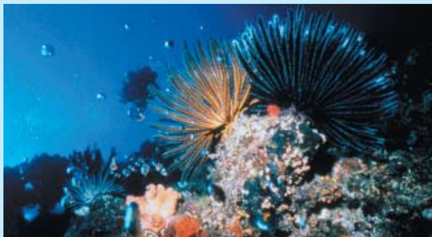
To become World Heritage listed the Great Barrier Reef had to be a unique, rare and superlative natural phenomena