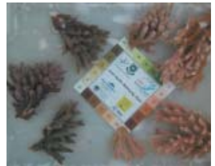
Above: Differences in colour in the coral are measured with the Coral Health Chart (University of Qld). The light corals (right) are from a clear-water offshore reef and the dark corals from a turbid inshore reef (K. Fabricius 2006)

The results are encouraging and may help to reduce the high costs of regular water quality monitoring over such a huge area.