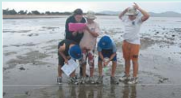
Belgian Gardens State School students monitor seagrass at Rowes Bay

Year six and seven classes at Belgian Gardens State School in Townsville have formed the Rowes Bay Junior Ranges. As part of this group, students conduct regular clean ups of Rowes Bay beach and help to monitor seagrass with the help of the Department of Primary Industries. The school also took advantage of the free educational trip to Hinchinbrook Island, offered by the Reef Guardian School programme, to head over and learn a bit more about their environment and conduct a clean-up on the island.