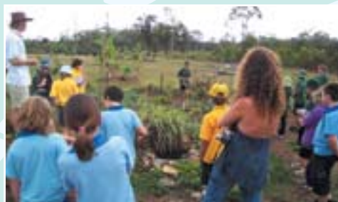
Wartburg State School students show schools their gardens

Wartburg State School encompasses all that is environmentally friendly. They are leaders in managing their school's grounds and living sustainably. With parent and volunteer help, the students have created mini habitat areas around the school grounds. These include a native garden, a permaculture garden, a vegetable garden and a bush tucker garden. The students had to remove weeds and completely revegetate the areas. The students also looked at how they could stop sediments from running into the wetland area behind their school and therefore improve the quality of water entering the Reef. This is Wartburg's first year in the Reef Guardian School programme.