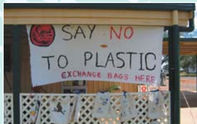
Comet State School held a 'Say No to Plastic! Day' within their small community

Students at Comet State School approached their local store to support them in minimising the use of plastic bags within their small community. The school recently held a successful community 'Say No to Plastic! Day'. Community members traded 100 plastic bags for the school's Reef painted calico bags.