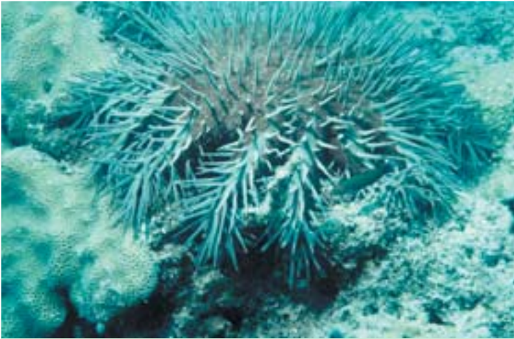
Funding is helping to control crown-of-thorns starfish

For information, including training on control methods, or to apply for site selection, call the Association of Marine Park Tourism Operators on (07) 4044 4990.