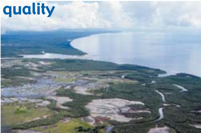
The quality of water entering the Reef is set to improve following a funding boost