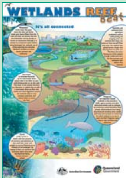
An educational poster explaining the wetland connection

Reef HQ is open from 9:30am to 5pm, 7 days a week, everyday of the year except Christmas Day and is located at 2-68 Flinders Street, Townsville, Queensland.