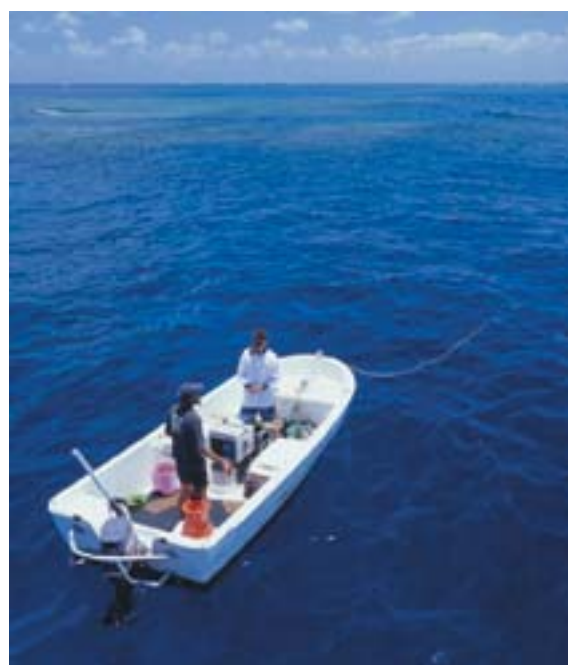
A CRC Reef researcher and commercial fisherman record, tag and measure fish during the experiment.

For more information about the ELF Experiment visit the CRC Reef website at http://www.reef.crc.org.au/research/fishingfisheries/elf.html .