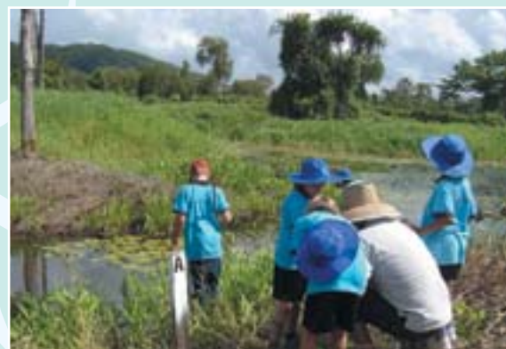
Students from Wonga Beach State School adopted their local wetland

In 2005, Wonga Beach State School in Cairns adopted a wetland area behind their school. The wetland was completely degraded with overgrown weeds and bad water quality that was leading out to the Reef. The students worked in partnership with their local council to clear the weeds and plant over 1000 native trees. The students helped test and monitor water quality and brought back native birds to the area.