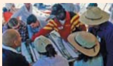
The GBRMPA and Traditional Owners working together

For more information on any of the above programmes, contact the Indigenous Partnerships Liaison Unit on either: ph 1800 802 251 or (07) 4750 0700; or email tumras@gbmpa.gov.au .