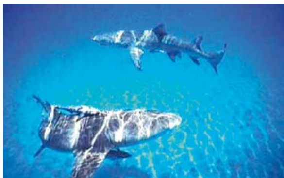
Figure 13.1 Compared to bony fish, sharks live for a long time, grow slowly and produce few young. As a group, they have relatively slow rates of evolutionary change and are sensitive to intense human pressures. Once depleted, shark populations can take considerable time to recover.

This reproductive strategy also makes sharks vulnerable to unnaturally high levels of adult mortality. A K-selected life history strategy means that the number of young produced is closely linked to the number of breeding adults. Thus, as the number of adult sharks declines, the number of new recruits entering the population may also decline. As a result, shark populations can be reduced relatively quickly and once depleted, may take a long time to recover. For example, demographic analyses of sawfish populations in the western Atlantic suggest that even if effective conservation measures are introduced, recovery of these populations could take several decades 64 .