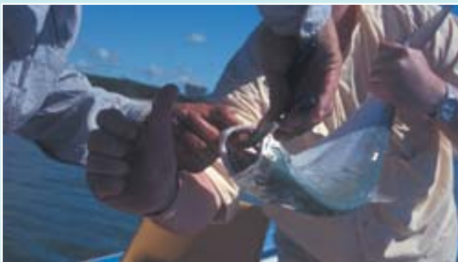
Removing hook for release