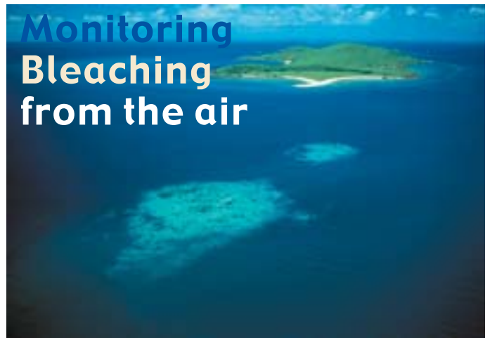
An aerial photo of a bleached reef

The Great Barrier Reef Marine Park Authority is working with Coastwatch and charter operators to help detect and monitor coral bleaching on the Great Barrier Reef as part of the BleachWatch (Aerial) Program.