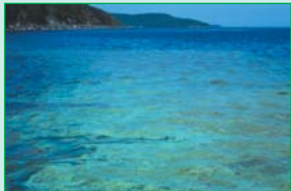
The algae Trichodesmium

If you see an oil spill in the Great Barrier Reef Marine Park, contact the EPA Hotline on 1300 130 372 urgently.