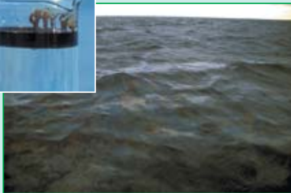
An oil spill

"Reports of oil spills need to be confirmed as it is sometimes difficult to tell if the slick is really just coral spawn or an algal bloom" James said.