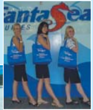
Fantasea staff displaying the environmentally friendly blue bags

Whitsundays based tourism operator Fantasea cruises recently delivered a free re-useable shopping bag to every household on the Whitsunday Coast in an initiative aimed at protecting the marine environment.