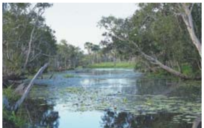
Aligator Waterhole, Tedlands Creek. Photo: Vern Veitch 2004

Hugh said all levels of government are also focusing on maintaining and protecting wetlands in the Great Barrier Reef Catchment through initiatives like the Great Barrier Reef Coastal Wetlands Protection Program and the Reef Water Quality Protection Plan.