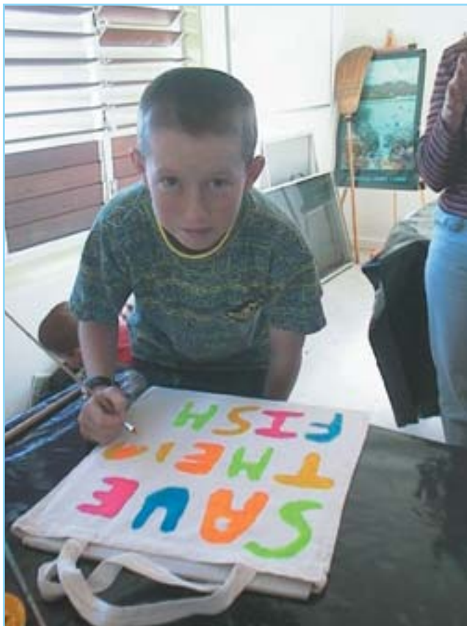
A student paints a calico bag at the North Keppel Environmental Education Centre