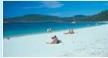
Beautiful Whitehaven Beach, the Whitsundays