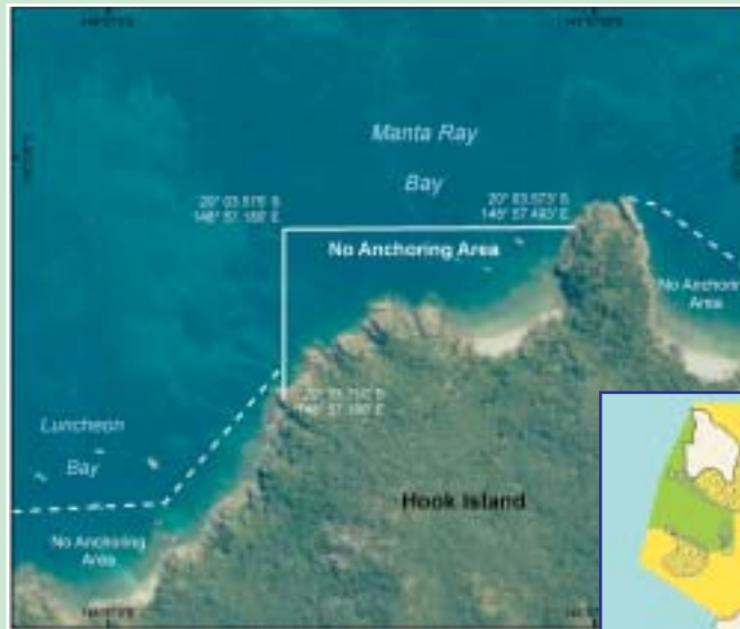
A detailed map of the no anchoring area at Mantaray Bay

Manta Ray Bay (as shown on the map) and Bait Reef are no anchoring areas, however they are unmarked. Operators must use coordinates and landmarks to ensure they do not anchor within the no anchoring area.