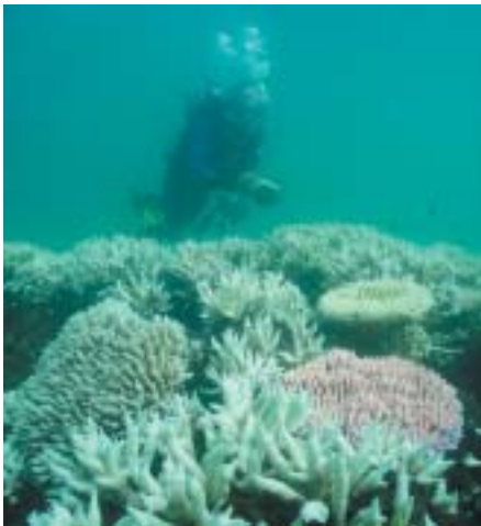
Undertaking coral bleaching surveys

Coral bleaching in the southern section of the Great Barrier Reef was inspected first-hand by leading Australian climate change experts.