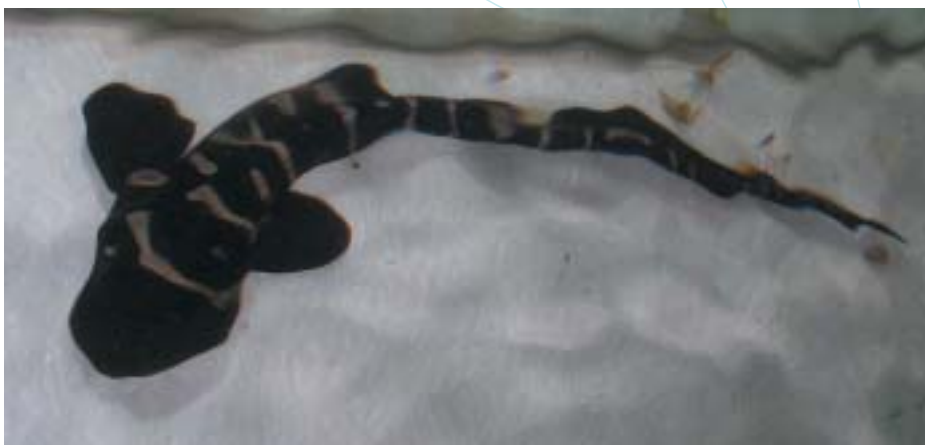
The baby leopard shark can be seen in the tanks of Reef HQ

Reef HQ is open from 9.30am to 5.00pm, seven days a week, everyday of the year except Christmas Day.