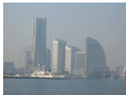
The water quality in Tokyo Bay will continue to improve due the efforts of the government and communities