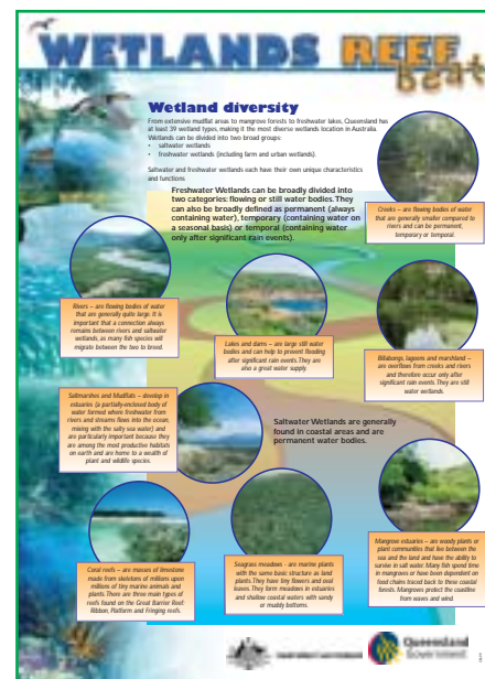
An educational poster describing the types of wetlands in Queensland

To find out more about wetlands and for a free copy of 10 colourful wetland Reef Beat posters phone the GBRMPA on (07) 4750 0700.