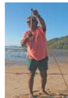
Indigenous groups are being encouraged to participate in tourism in the Great Barrier Reef Marine Park

For more information contact GBRMPA on (07) 4750 0700 or visit the website at www.gbrmpa.gov.au .