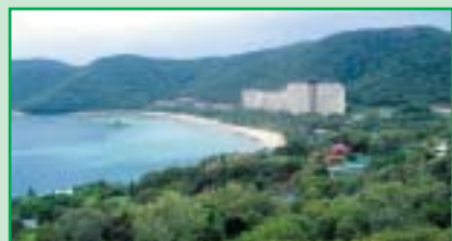
Hamilton Island is within the World Heritage Area however does not form part of the Great Barrier Reef Marine Park

A recent oil spill in Gladstone Harbour highlighted the confusion some people have about how the Great Barrier Reef Marine Park differs from the Great Barrier Reef World Heritage Area.