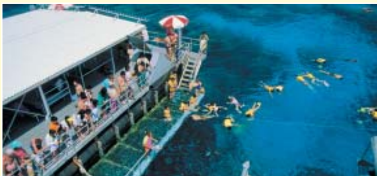
Tourism in the Great Barrier Reef catchment contributes $5.1 billion each year to the Australian economy

"Our Tourism and Recreation Reef Advisory Committee supports the GBRMPA giving local operators the information and tools to more effectively promote the Marine Park."