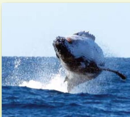
Sightings Network photograph of a humpback whale in the Whitsundays taken by Tanya Drury, Islandive.

For further details please contact Lorelle Schluter on 07 4750 0705.