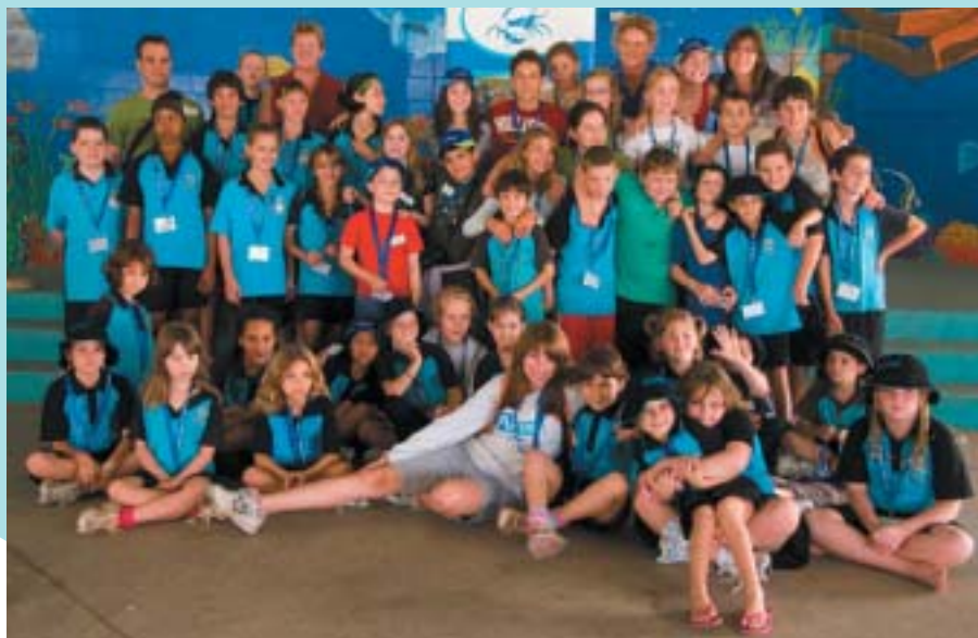
Winners of the National Geographic Kids Hands-On Explorer Challenge Expedition Team and students from Hambleton State School participate in the Great Barrier Reef Marine Park Authority's Reef Guardian Schools Program

"The students also learned about permaculture by visiting Hambleton State School's water wise native garden which promotes using native plants to