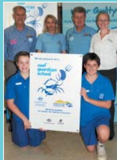
Mundingburra State School becomes the 148th Reef Guardian School

"We are pleased to support the Great Barrier Reef Marine Park Authority's Reef Guardian Schools Program, which is helping schools such as Mundingburra State School to undertake on ground environmental activities and to make a commitment to the future protection and conservation of the Great Barrier Reef," he said.