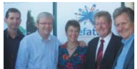
Russell met with Prime Minister Kevin Rudd during the launch of the Reef Atlas