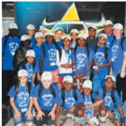
Students from Cape York enjoyed learning first hand from marine managers during a visit to Townsville

Students taught each other about permaculture gardening, water conservation and how to look after wetlands and seagrass.