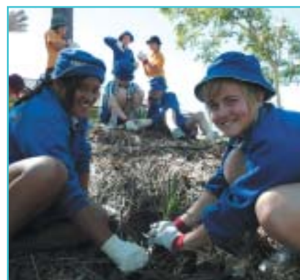
Students from St Margaret Mary's College in Townsville helped to green up a local riparian area in order to help protect the Great Barrier Reef