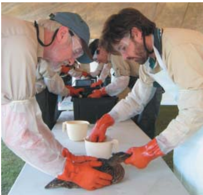
Marine Park staff were trained to clean marine animals so they will be ready to assist in the event of an oil spill

To report oil spills please call (07) 3830 4919 or 0427 969 384 and quote 'oil spill.'