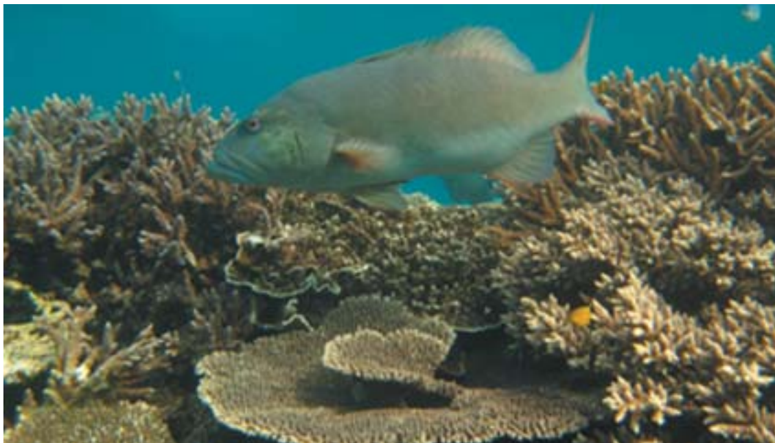
Coral trout are among the most popular species targeted by Queensland's commercial and recreational fishers

A team of marine scientists has shown that coral trout populations on the Great Barrier Reef increased by between 31 and 75 per cent on reefs closed to fishing.