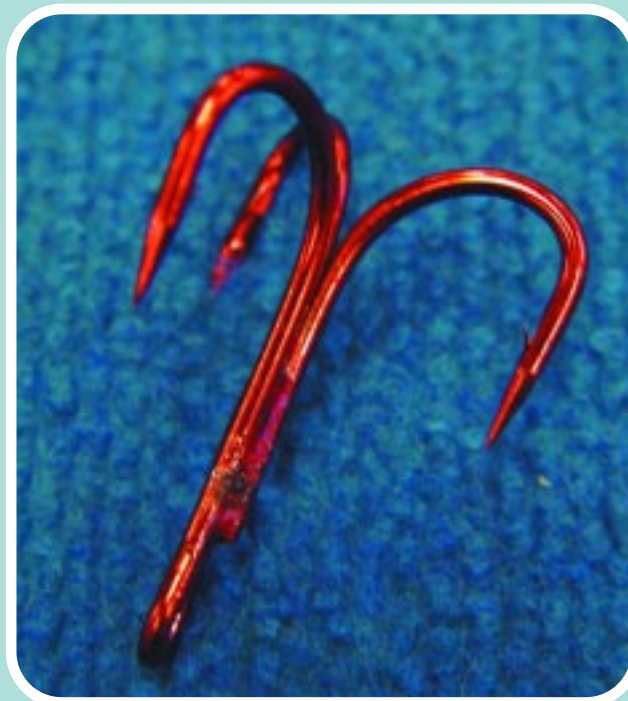
Single-shanked treble hook