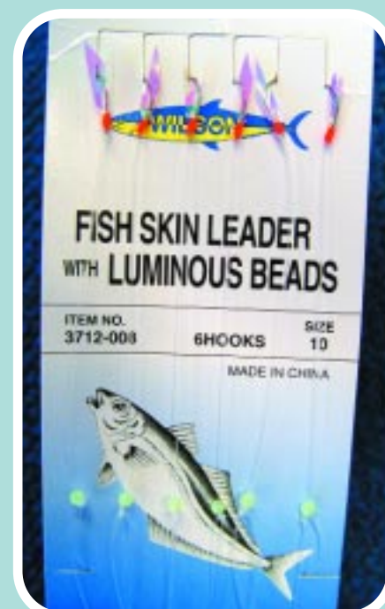
Bait Jig comprising no more than 6 small hooks sized between Number 1 and 12 (inclusive)