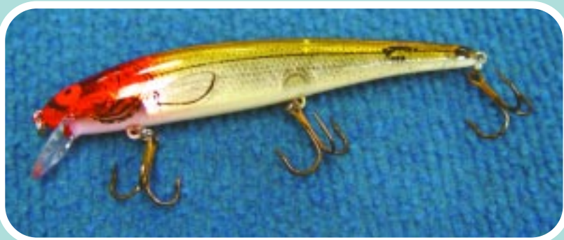
Lure (an artificial bait with no more than 3 hooks attached)