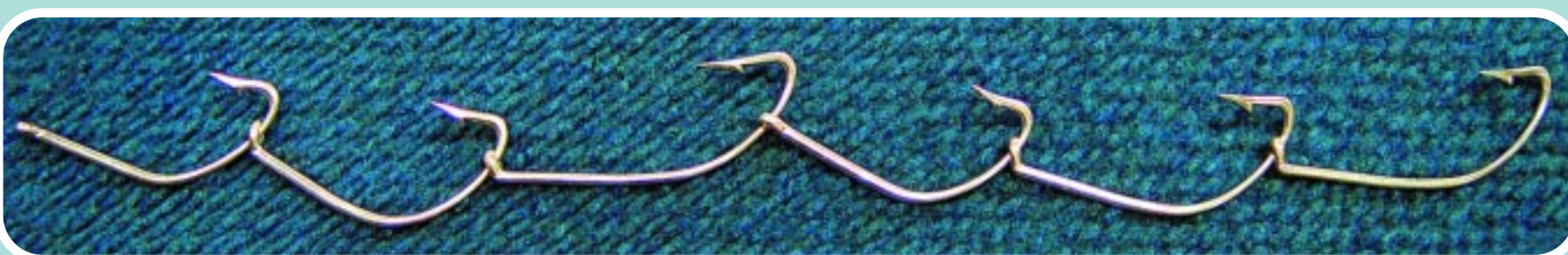
Ganged hook set comprising no more than 6 hooks (each of which is in contact with at least one other hook in the set)