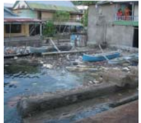
Example of pollution facing reefs in Indonesia

The three biggest threats to coral reefs in Indonesia are destructive fishing practices (the use of cyanide and dynamite), over fishing, pollution and habitat destruction - along with climate change.