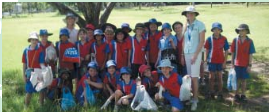
Wulguru students show off their haul of litter

The Great Barrier Reef Marine Park Authority in partnership with Burdekin Dry Tropics Natural Resource Management presented the official Reef Guardian Schools sign to the school before joining students in a school-wide clean up.