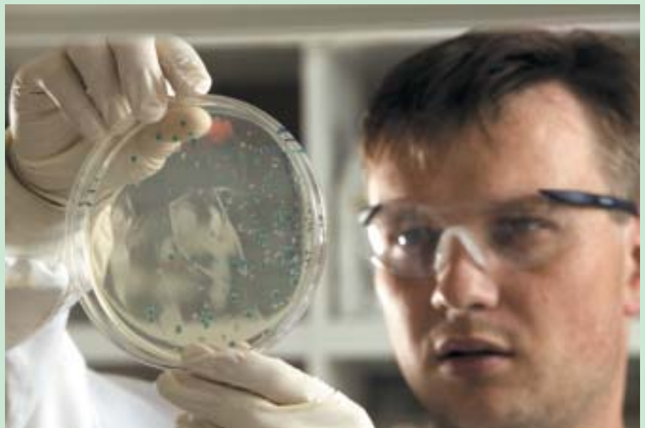
Examining an agar dish for bacterial colonies as part of the bioremediation project

CSIRO's search for the enzyme began with a search for bacteria that 'fed' on atrazine. Once identified, the team isolated the enzyme that broke down the chemical into non-toxic components and developed it to make it a product suitable for low-cost production and delivery into a range of situations.