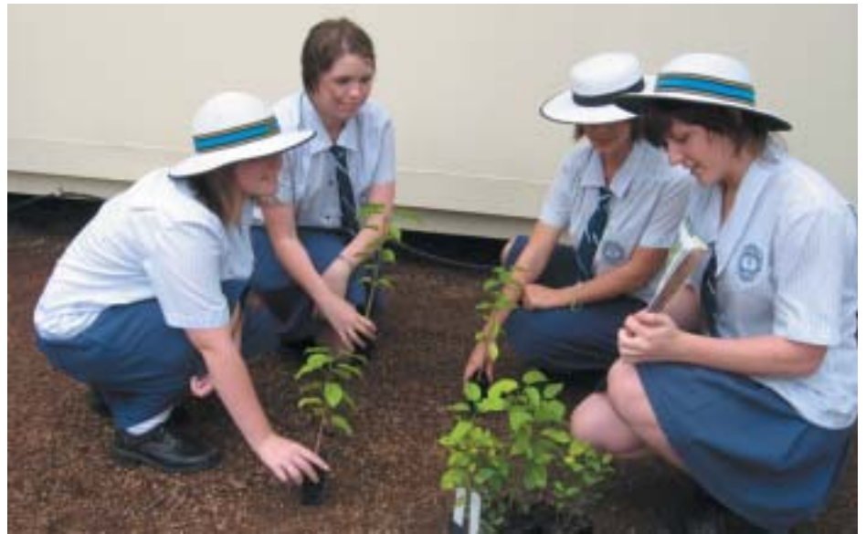
Students from St Patrick's study up on coastal plants

The 60-page booklet called 'Coastal Plants of the Burdekin Dry Tropics' was produced by Burdekin Dry Tropics NRM in conjunction with Coastal Dry Tropics Landcare Incorporated.