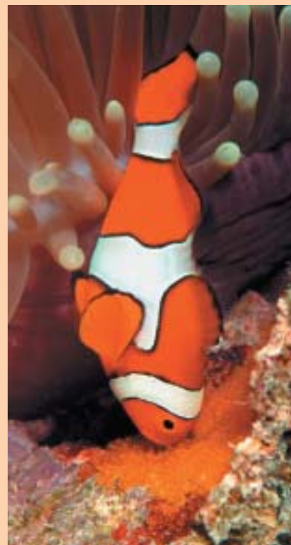
Clownfish eggs are tended by the male until they hatch. After hatching the tiny larvae spend 11 days in open water before they settle into adult habitat on the reef.

The paper 'Ocean acidification impairs olfactory discrimination and homing ability of a marine fish' is available at www.coralcoe.org.au .