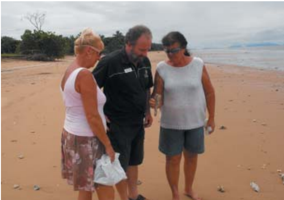
Residents from Balgal Beach learn more about their coastline.

Sightings of unusual marine life – 07 4750 0700 (GBRMPA)