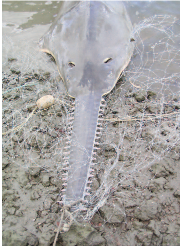
Freshwater sawfish, Pristis microdon .

Legislated management tools for the conservation of sawfish that occur in the Great Barrier Reef World Heritage Area (the World Heritage Area) include the Fisheries Act 1994 (Qld); Great Barrier Reef Marine Park Act 1975 ; Environment Protection and Biodiversity Conservation Act 1999 ; Great Barrier Reef Marine Park Zoning Plan 2003 (34 per cent of the Marine Park protected from extractive use) and the Marine Parks (Great Barrier Reef Coast) Zoning Plan 2004 ; and others (refer Management table, p. 12). All species of Pristidae are now listed as protected species under Great Barrier