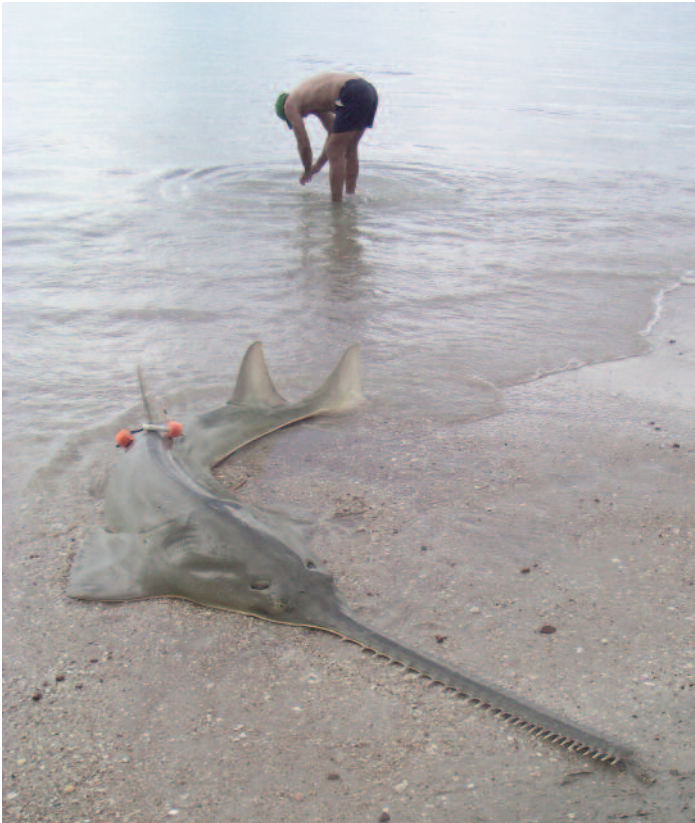
Green sawfish, Pristis zijsron , tagged for monitoring.